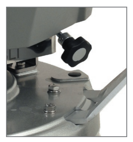
The front knob makes the brush head easy adjustable ...