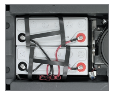
The XFC batteries special (standard in the Long Run version) guarantee up 2 hours of running time