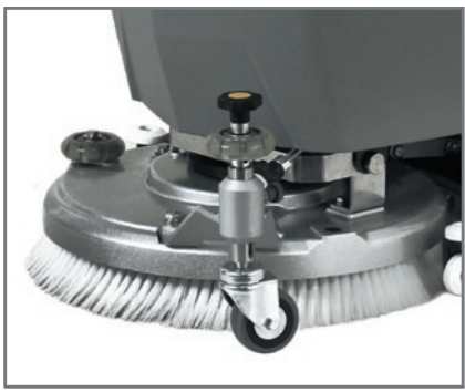
... while the practical external wheel allows the user to adjust it in height, making Freccia 15 perfectly suitable for any kind of floor