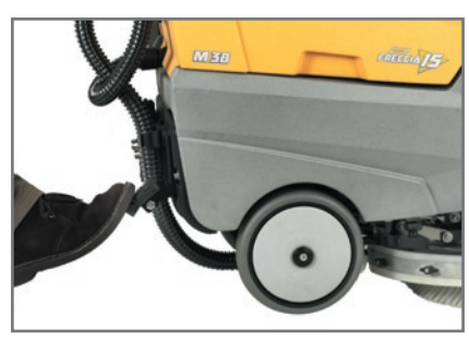
New squeegee pedal lifting system; even Recovery tank: easy to clean ... more practical and reliable