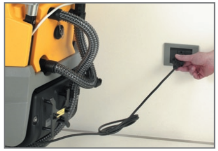
Standard on-board battery charger; for a quick recharge of the machine at any convenient location