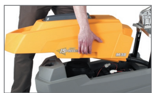
... it can be easily removed as well, to transport, empty and clean it without any effort