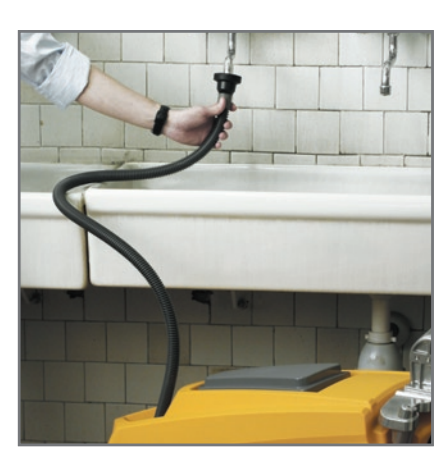
The solution tank can be quickly filled thanks to the wide filling port and the practical filling hose

Then a perfect mix of solutions - the 15l capacity, the adjustable head, the practical external wheel, the innovative squeegee system with pedal lifting – which make Freccia 15 a point of reference in its segment and the ideal solution for small medium area.