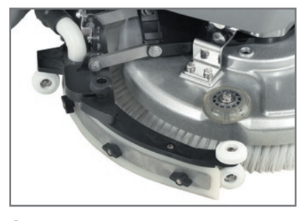
Compact squeegee: immediately behind the brush, able to curve up to 270°, so completely covering the cleaning path (even on sharp curves); for perfect drying results